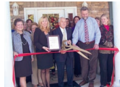
Alcoeur Gardens new Toms River facility Grand Opening/Ribbon Cutting.