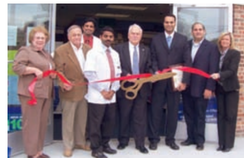
Holiday City Pharmacy Grand Opening/Ribbon Cutting.